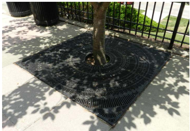
Example of Grate at University Center